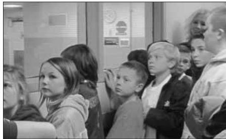
Soccer Club of Springfield players tour Children's Specialized Hospital in Mountainside.