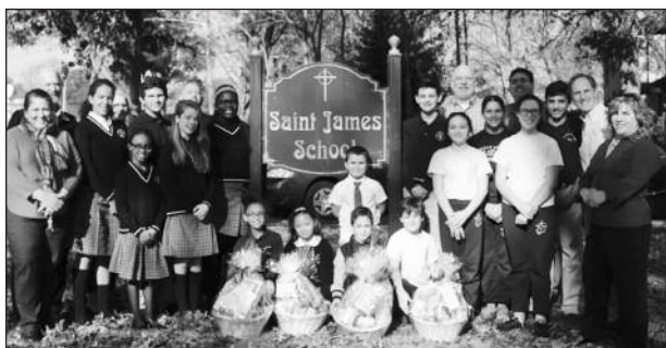
Students from Saint James School that put together the beautiful Thanksgiving baskets.