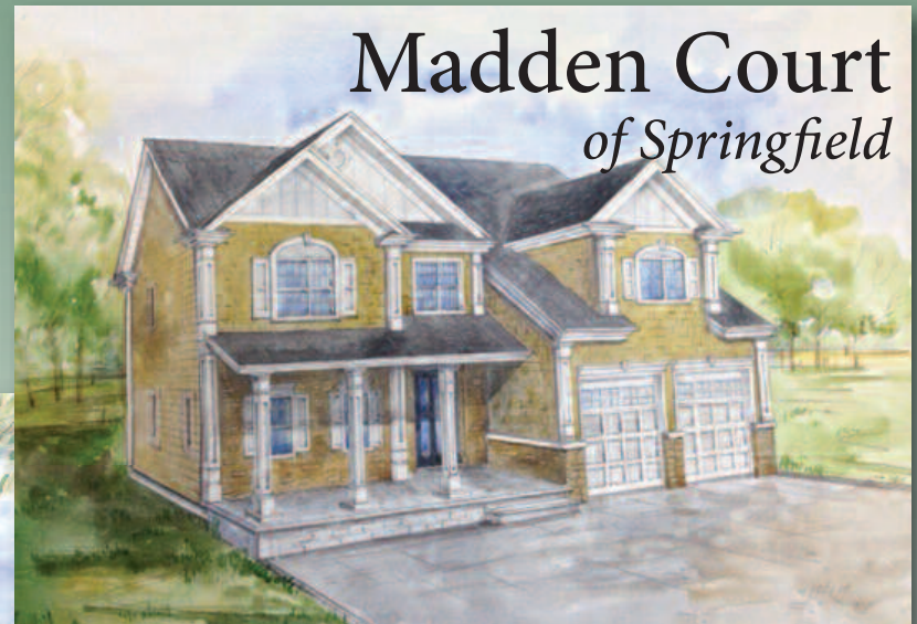
Madden Court of Springfield

Interested in Selling or Purchasing a home? Let Wolf Premier Properties represent you in your next transaction.