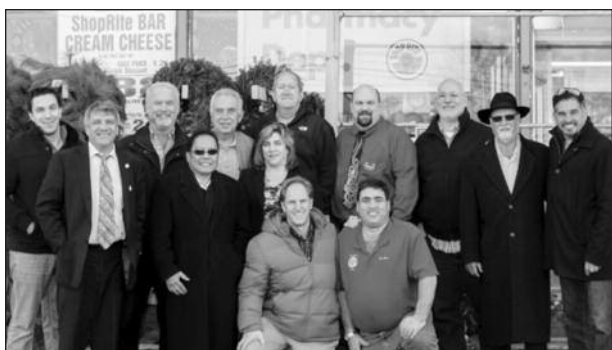
Rotary and HOPE members prepare to deliver the baskets.