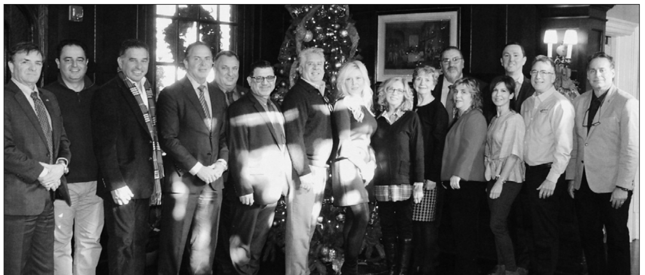
Business Improvement District annual holiday breakfast meeting at Baltusrol Country Club Celebrating the towns successes of 2018 and the bright future of Springfield for 2019