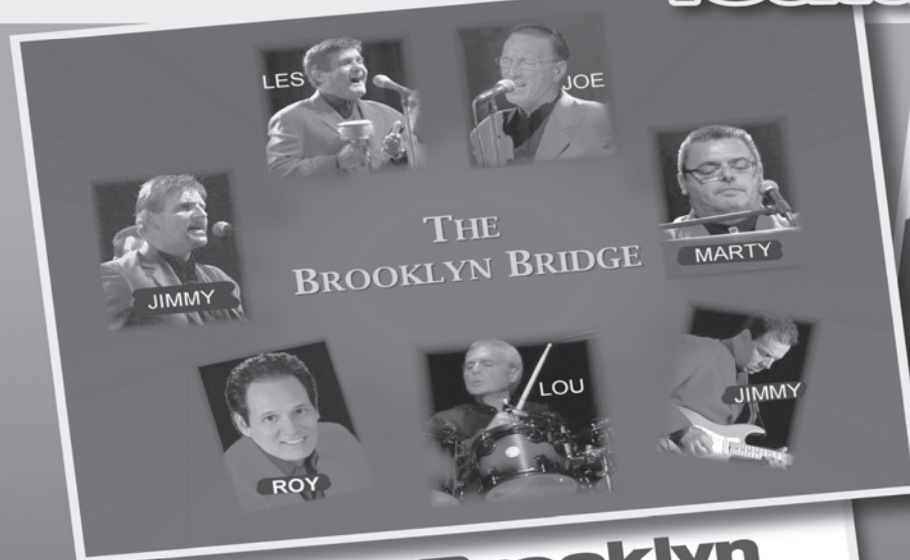
The Brooklyn Bridge