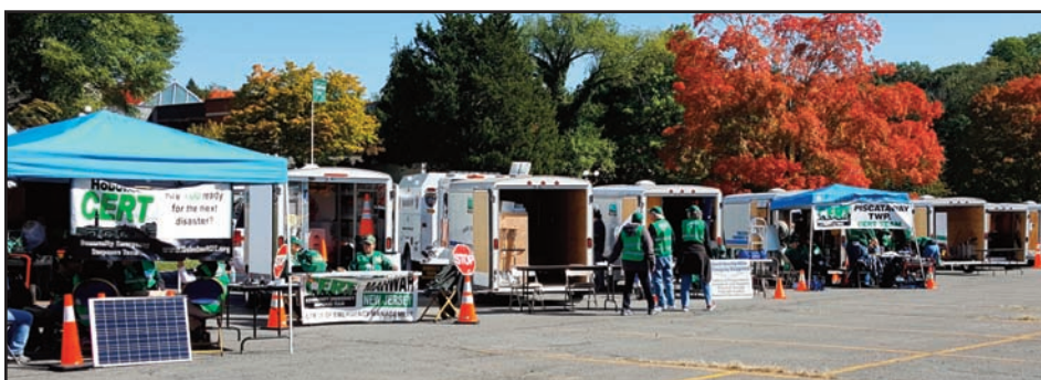
CERT members show off their trailers at the "ROAD EO".

100 Morris Avenue, Suite 200 Springfield, NJ 07081 (908) 789-3200 • Cell (973) 886-9901 Fax: (908) 789-3326