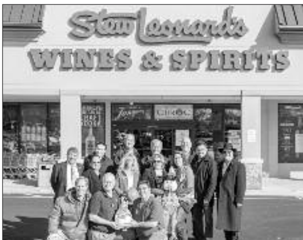
Members of Springfield Rotary and Springfield HOPE pose in front of Stew Leonard's who donated 20 turkeys.