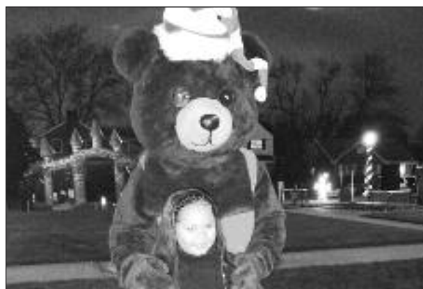
The strolling holiday bear poses with a Springfield youth.