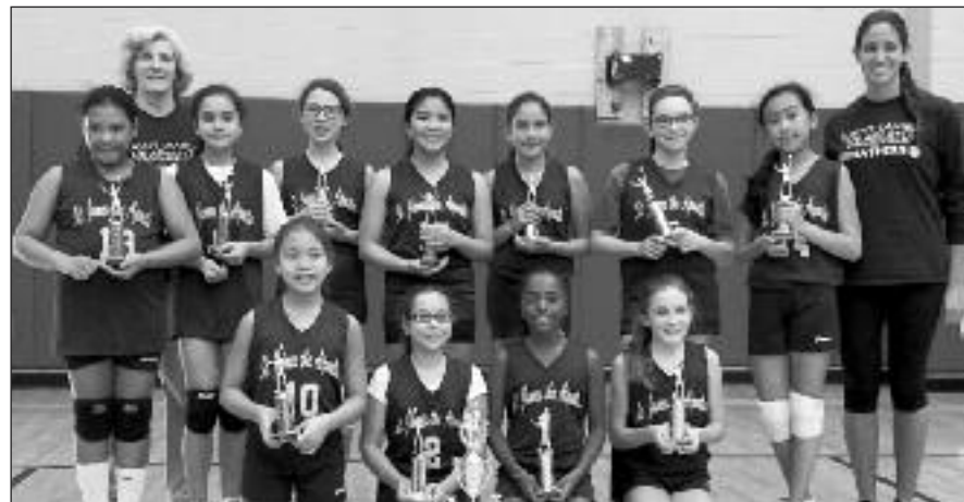
Saint James The Apostle School Junior Varsity Girls Volleyball Team