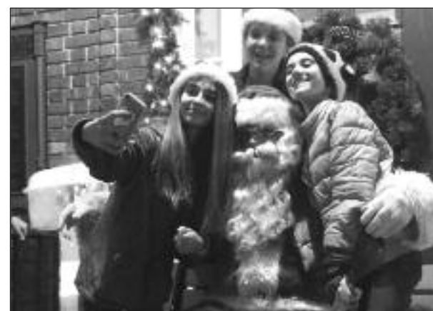
Children take a selfie with Santa on the steps of Town Hall