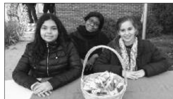
Members of Jonathan Dayton High School's Alternatives Club distributed glow sticks donated by the BID.