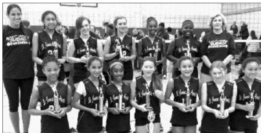
Saint James The Apostle School Varsity Girls Volleyball Team

Saint James the Apostle School has been serving the parishioners of Saint James the Apostle Church in Springfield and surrounding communities since 1953. Saint James the Apostle School offers students from PreK-3 through grade 8 a Roman Catholic faith-based education which acknowledges each child's individual ability to achieve their fullest potential academically, socially, and spiritually.