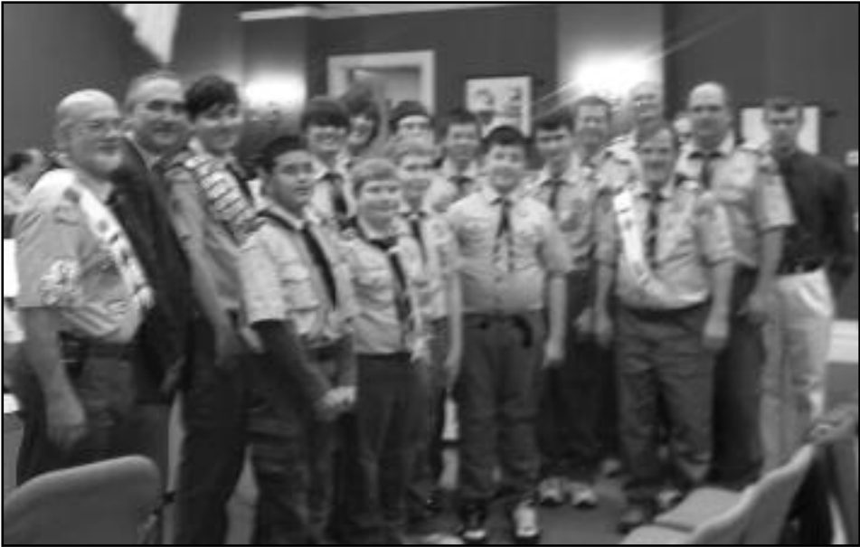
(above) Scouts and leaders pose at Town Hall on February 9th.