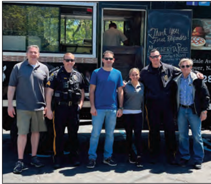
Springfield Police and OEM