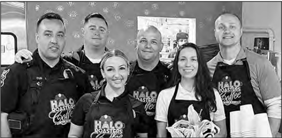
There was no agenda or speeches, just a chance to have a casual conversation with local police officers.