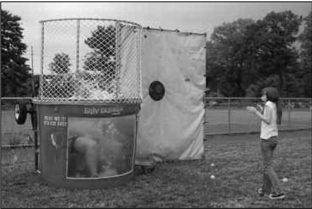
the last laugh as the Mayor flounders in the tank of water.