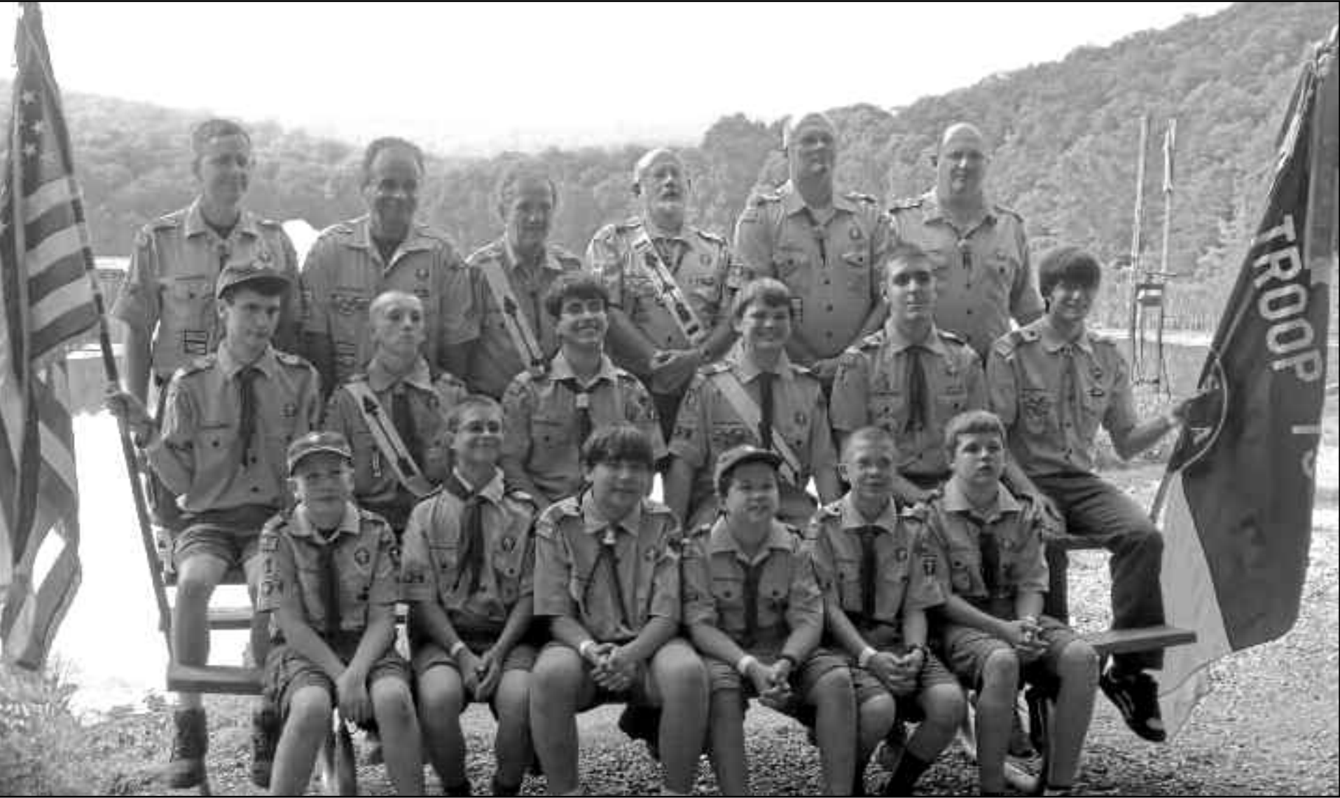
Twelve Scouts and six leaders from Troop 73 enjoyed summer camp this July at Mount Allamuchy Scout Reservation in Stanhope.