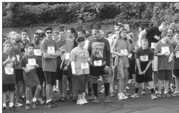
Runners get ready for the Second Annual Sprint for Springfield School 5K Race/Walk held Sept. 30.