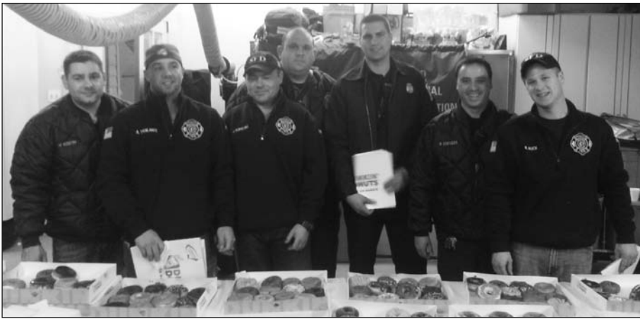
Members of Springfield Fire Department FMBA Local 57 continue their annual tradition handing out hot chocolate and doughnuts at the township's annual tree lighting.