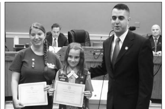
Representative from Girl Scouts with the Mayor