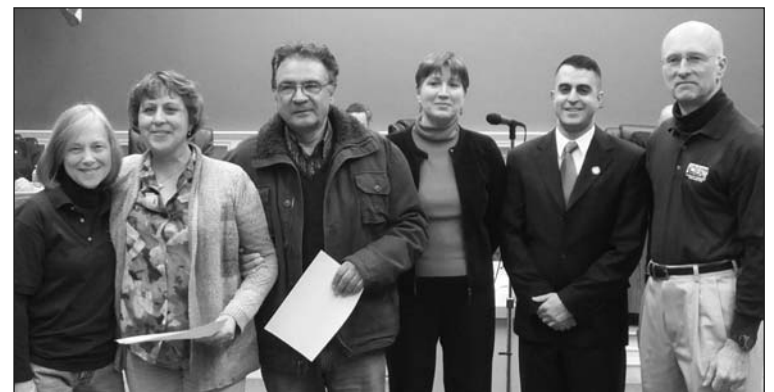
Volunteers Receive Their Awards With The Mayor