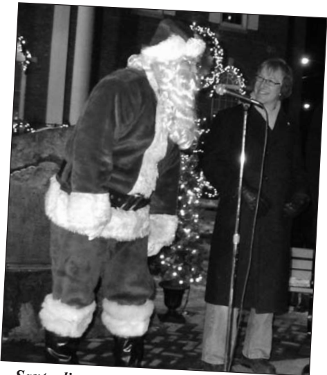
Santa discusses the naughty and nice list with the Mayor!