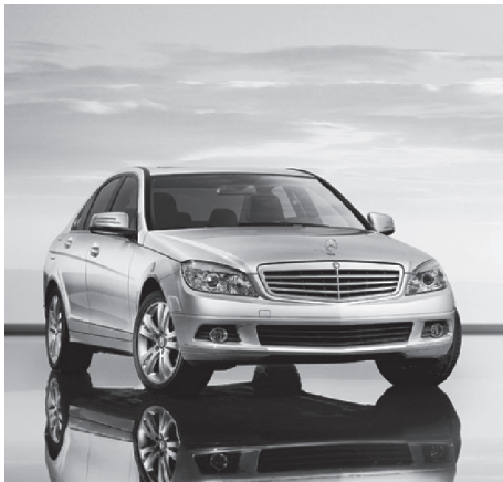
2010 C350 SEDAN

Choose a Certified Pre-Owned Mercedes-Benz and drive with confidence.