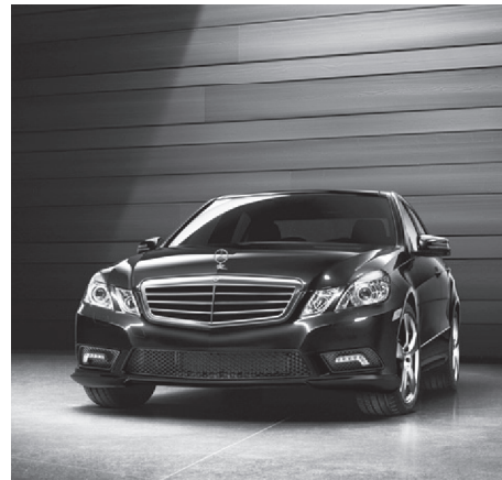
2010 E350 4MATIC® SEDAN

VIN #AF426677, Stk #P2096, 6 cyl, auto, navi, iPod, Bluetooth, black/black, 34,819 mi.