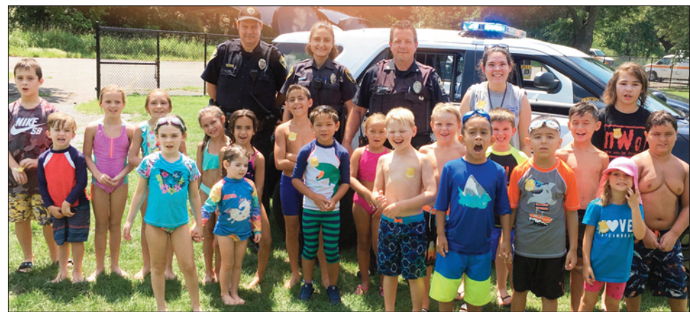
Springfield Police and Auxiliary Police