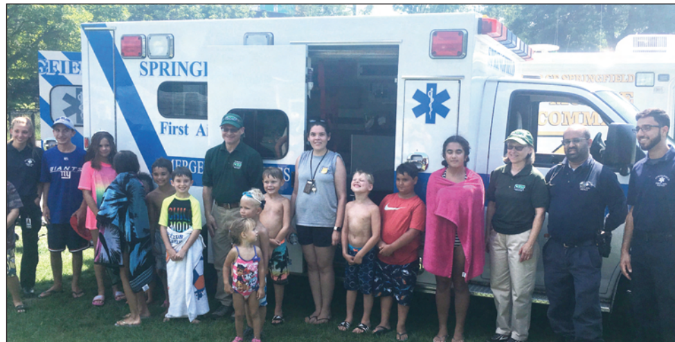
Springfield First Aid Squad

First Responder Day was a big hit for the kids at the Springfield Pool on Sunday, August 5th. Despite the heat, Springfield's Police, Fire, First Aid Squad and Emergency Management Volunteers turned out for the afternoon and brought their equipment to show the children.