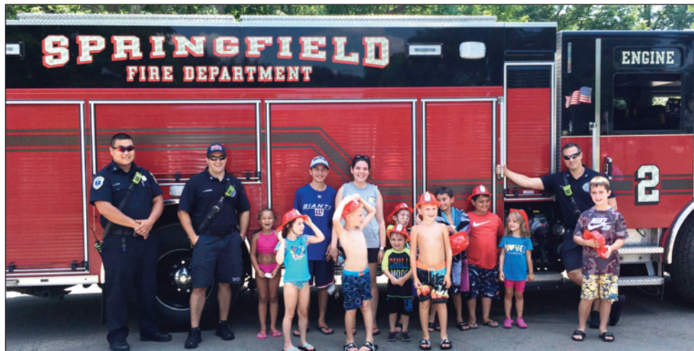
Springfield Fire Department