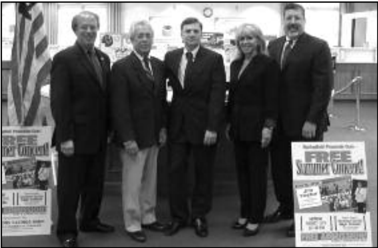
Chamber of Commerce Officials meet with Investors Savings Bank to accept their sponsorship check for the third annual Springfield free summer concert to be held on Monday August 10, 2009 at 730 PM.

sponsor of this year's concert. Additional sponsors include Springfield Chamber of Commerce, Take Pride in Springfield Committee and Cardinal Land Properties, Inc. and Licensed Real Estate Brokers.