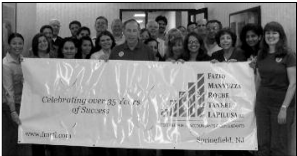
(above) Members of Fazio, Mannuzza, Roche, Tankel, LaPilusa, LLC, Springfield, participated in their first Alzheimer’s Jean Day to raise awareness and help the Alzheimer’s Association accelerate research and move closer to a cure. FMRTL members were encouraged to wear purple and denim in exchange for a $5 donation to the Alzheimer’s Association. Pictured are members of the firm who supported Alzheimer’s Jean Day.