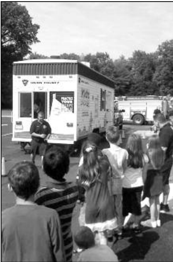
(above) Springfield Firefighters bring their own classroom to school. Students from Thelma L. Sandmeier Elementary School practice fire safety and escape planning. Fire Safety House is provided by the Union County Fire Prevention and Protection Association.

The next Fire Fighter 1 class will start at the end of August. Anyone interested in becoming a Fire Fighter should call Fire Headquarters at 973-912-2265 to learn more about joining the Springfield Fire Department.