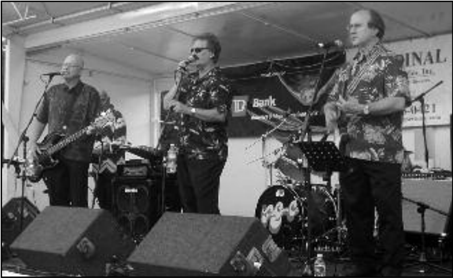
(above) The 1910 Fruitgum Company