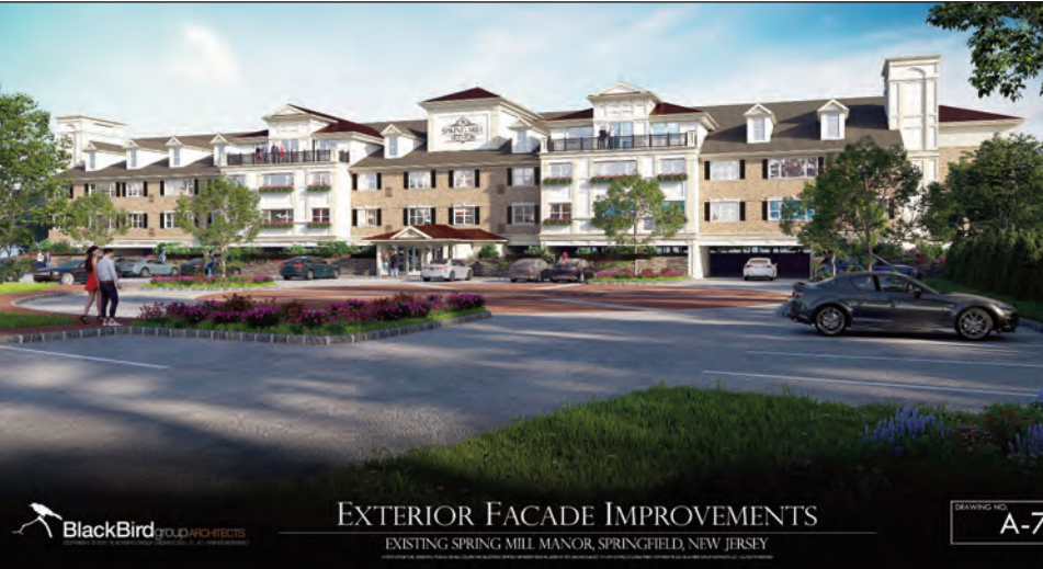
Improvements planned for existing project on Blacks Lane.