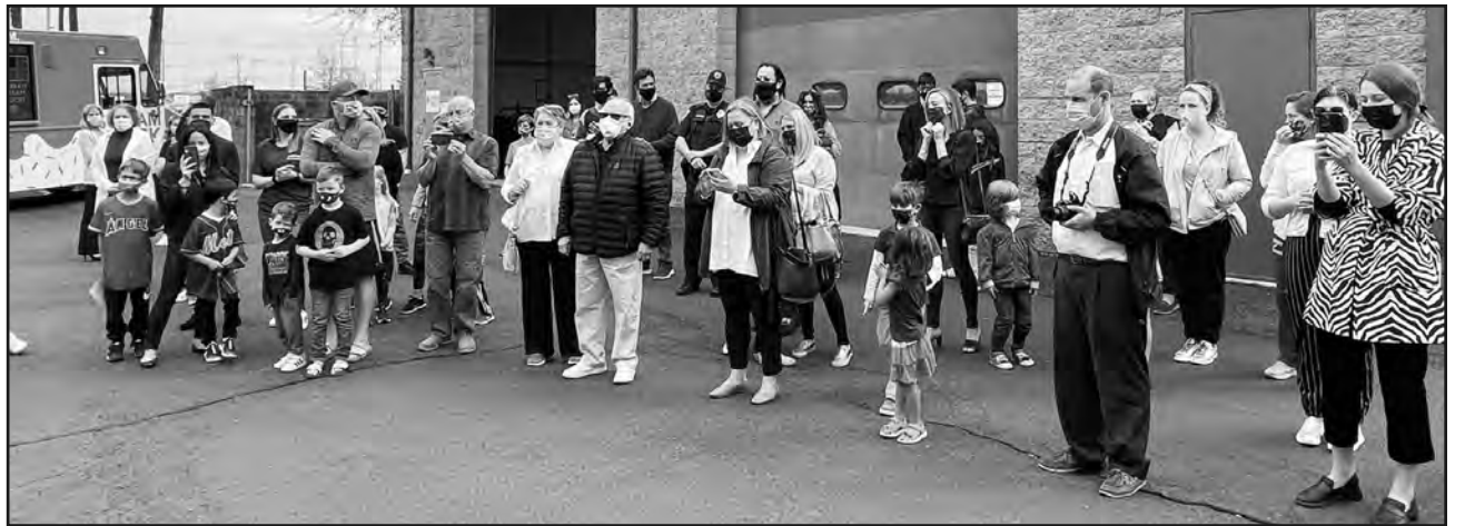
Family, Friends & Customers of Scream Truck

invites the community to its annual commemoration observing the 241st anniversary of the Battle of Springfield June 23, 2021 — 7:00 PM Weather permitting Battle Ground Cemetery 39 Mountain Ave., Springfield, NJ (across from the Municipal/Library parking lot) CandCdar@gmail.com