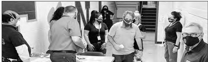
The Volunteer Team