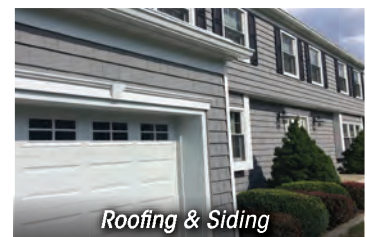
Roofing & Siding