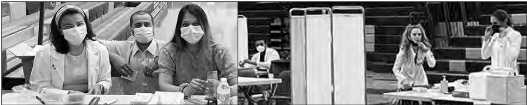
The Rite Aid Teams