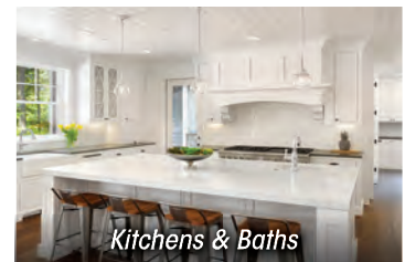
Kitchens & Baths