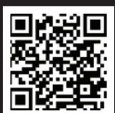
Scan To Visit Us Online

Experience the Difference! 170 Route 22 East Springfield, NJ