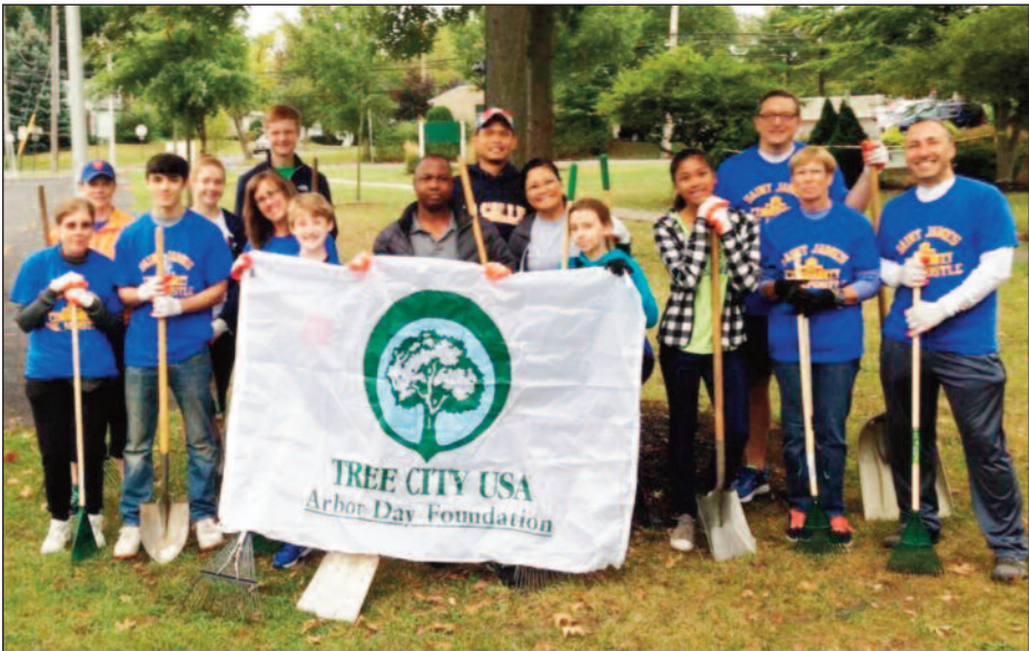
Volunteers from St James Parish mulched Veteran's park as part of a community wide service day. In addition to making the park look great the township also benefits from their assistance by maintaining our status as a Tree City USA and an Approved Community Forestry Program Community.

THE LAST DAY TO REGISTER TO VOTE FOR THE NOVEMBER GENERAL ELECTION IS TUESDAY, OCTOBER 18TH. THE TOWNSHIP CLERK'S OFFICE WILL BE OPEN UNTIL 8 PM