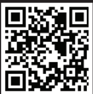
Scan To See How Autoland Gives Back!