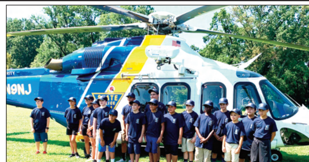
New Jersey State Police Helicopter Lands at Meisel Field.

Junior Police Cadets got a firsthand close up look at the helicopter.