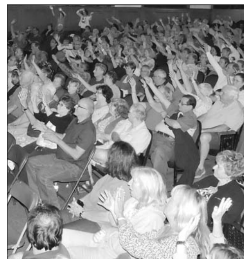
The crowd does a waving ovation to "Sweet Caroline"