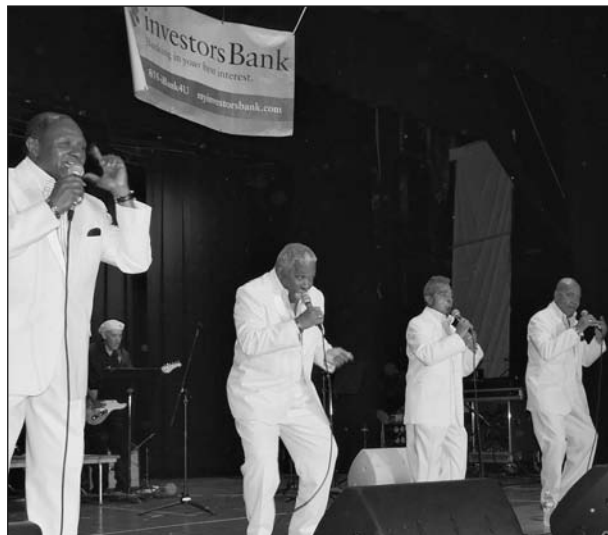
The Legendary Teenagers