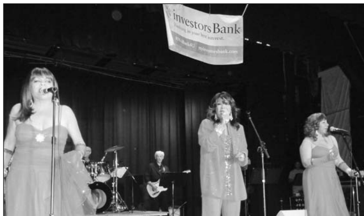
Shirley Alston Reeves