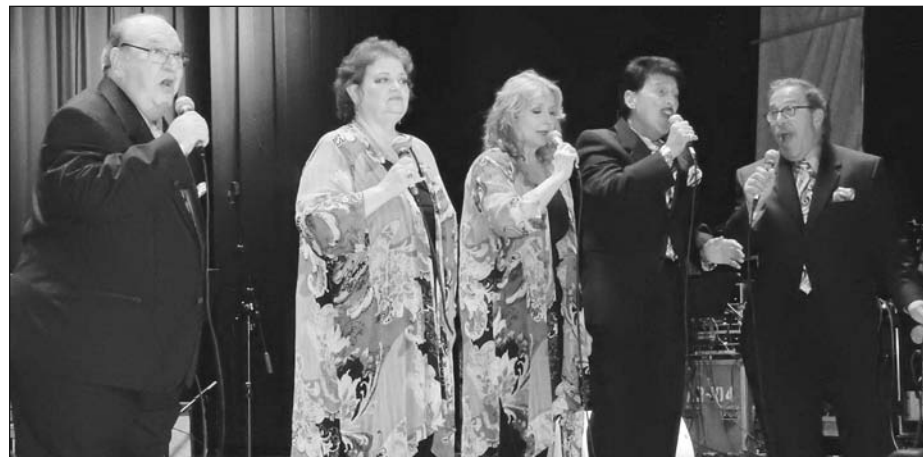
Egg Cream & Company