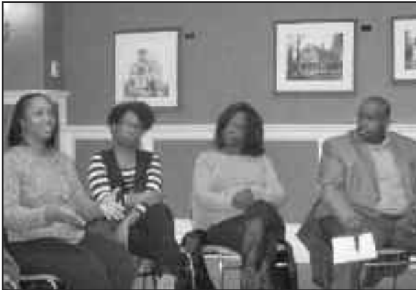
The annual Dr. Martin Luther King, Jr. observance was held in the Faigenbaum Courtroom at Town Hall. The event, sponsored by the Interfaith Clergy, was