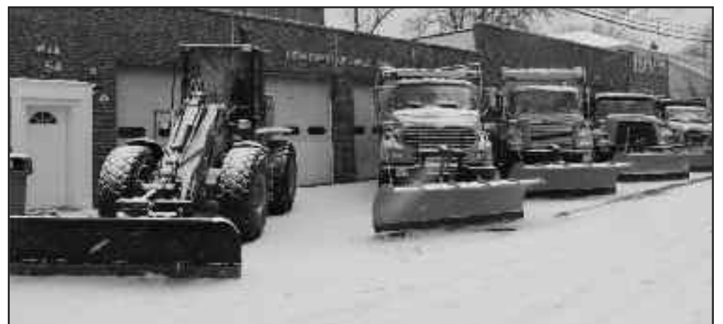
DPW plows lined up and ready for action on January 26, 2015.

JCP&L recommends that if an outage occurs as a result of the severe weather, customers should call 1-888-LIGHTSS (1-888-544-4877) to report their outage or click the "Report Outage" link on www.firstenergycorp.com via smartphone. Customers should immediately report downed wires to their utility or their local police or fire department. Customers should never go near a downed power line, even if they think it is no longer carrying electricity.