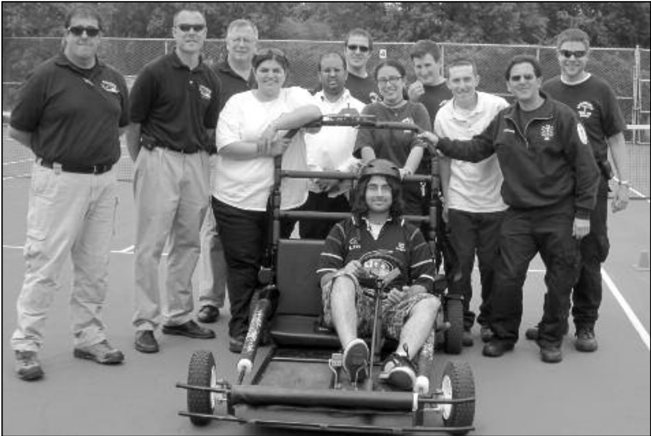
(above) Members of the First Aid Squad and UMDNJ-NorthSTAR flight team pose with a student before he takes to the course.