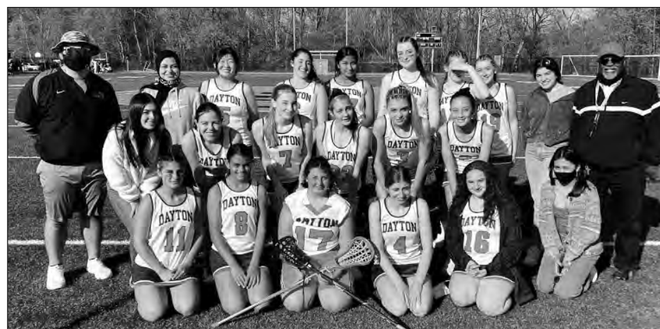
The First Dayton Girls Team EVER (Spring 2021)

Go Dayton LAX girls go! Fundraising and more fundraising is the norm for our Jonathan Dayton High School girls who play lacrosse! The goal of $18,000 was set back in June 2021 and our girls are $5,000 away! With a deadline fast approaching, they have kicked off their Luminary Fundraiser to try to raise the rest of the funds needed to play lacrosse in Spring 2022. Why is lacrosse always fundraising? Girls lacrosse is the newest sport at Dayton and, according to a recently modified policy, they have to wait five years to receive partial district funding. The Dayton girls and their parents are hopeful the policy will be revised and modified again in the near future. To help support the Dayton Girls Lacrosse Team, please consider participating in our "Light up Springfield for LAX" fundraiser. Luminaries can be purchased at springfieldlaxnj.com and are delivered directly to your home by December 31, 2021.