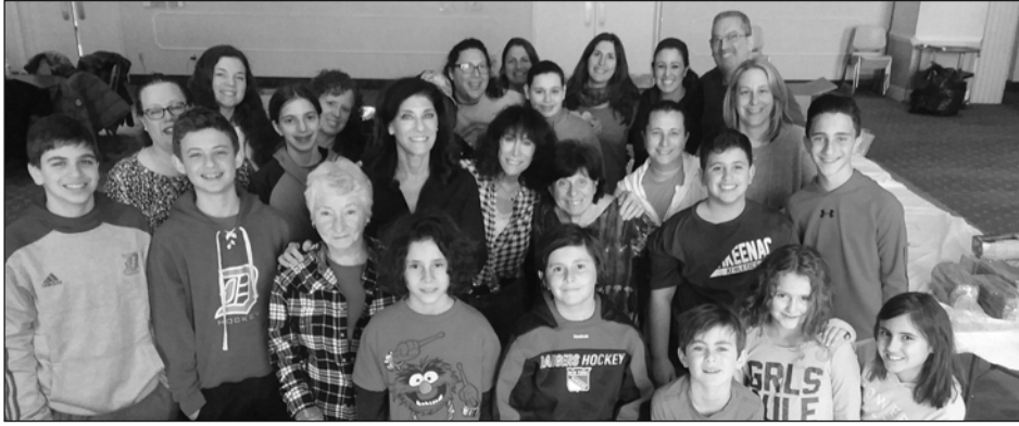
On January 13, a multi-generational group of volunteers from Temple Sha'arey Shalom, Springfield, packed over 100 lunches for clients of Bridges Outreach. Bridges Outreach in Summit NJ brings the housed and homeless together in community. Temple Sha'arey Shalom participates annually with Bridges Outreach in making meals and delivering clothing and food to homeless and needy clients in Irvington.