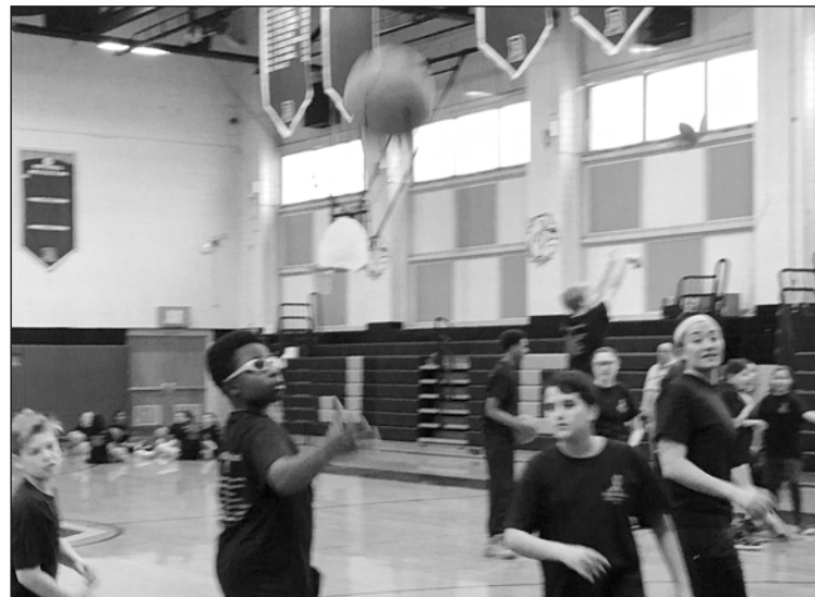
Participants practice shooting and rebounding drills.